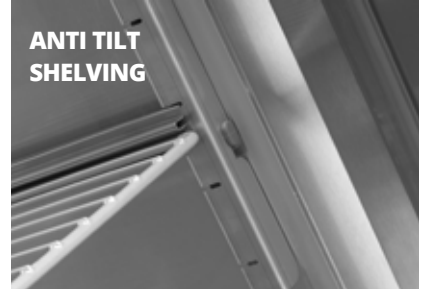
ANTI TILT SHELVING