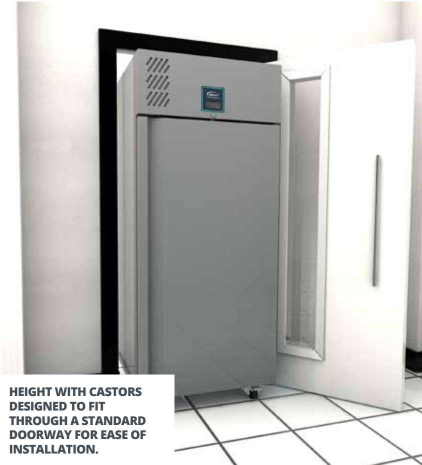
HEIGHT WITH CASTORS DESIGNED TO FIT THROUGH A STANDARD DOORWAY FOR EASE OF INSTALLATION.