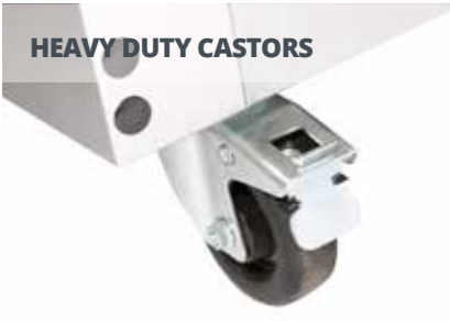
HEAVY DUTY CASTORS