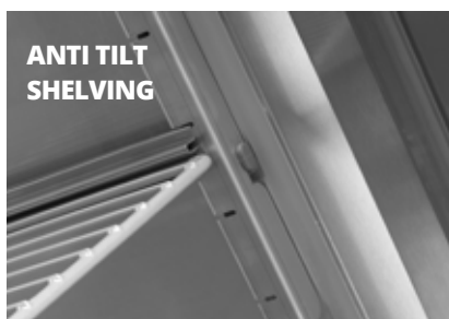
ANTI TILT SHELVING