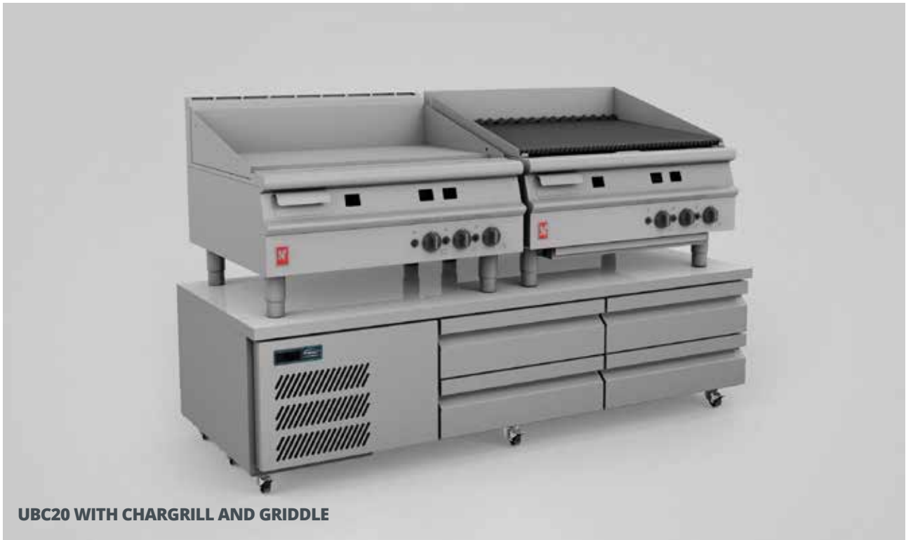
UBC20 WITH CHARGRILL AND GRIDDLE