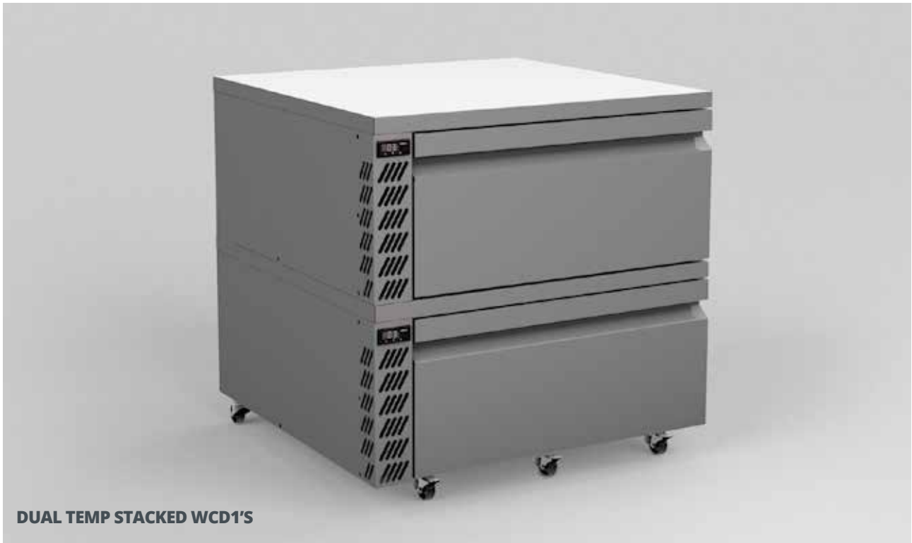
DUAL TEMP STACKED WCD1'S