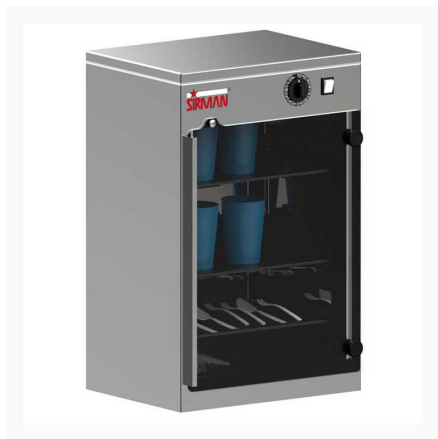
Sirman Sanitisation , model Ster Uvc 24w :

Sirman Spa Viale dell'Industria 9/11 35010 PIEVE DI CURTAROLO (PD), Italy Tel./Fax. +39 049 9698666 / +39 049 9698688 email: info@sirman.com