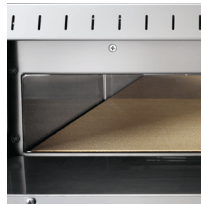
Refractory brick deck