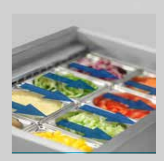
Unique air flow design with air curtain helps maintain 1°C temperature in pans.

Hydrocarbon refrigerant with low GWP/ zero ODP that respects the environment.