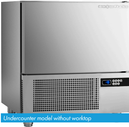
Undercounter model without worktop