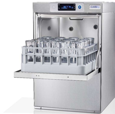
C400 & C400WS