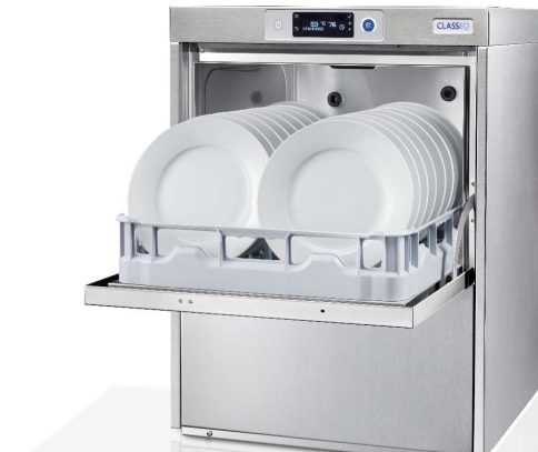
C500 & C500WS