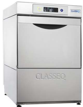
G350 / G350P

Still the best glass washing option for small spaces. .