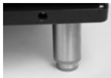
Adjustable legs (from 101-152mm) available with optional leg kit K-00345.