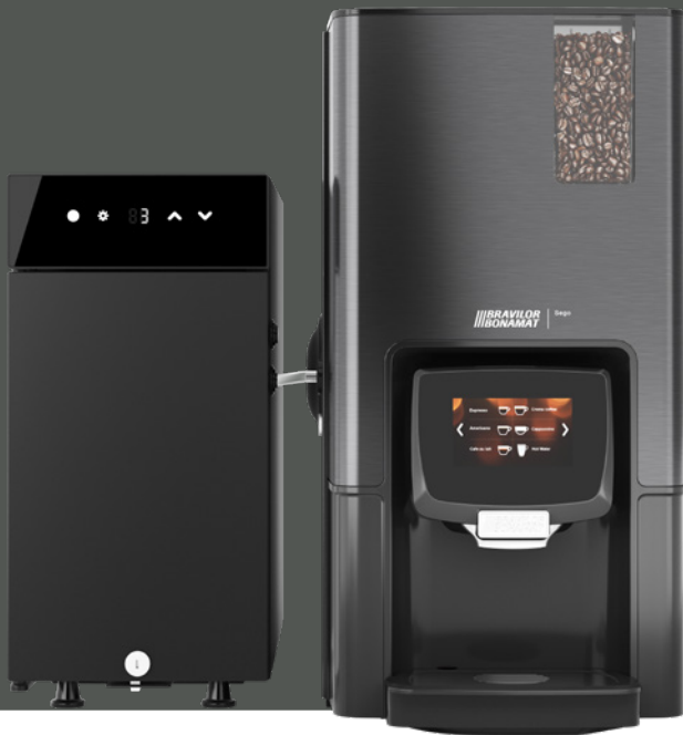
Sego L Fresh Milk with milk fridge