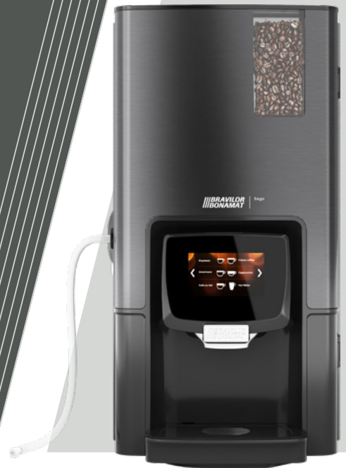
Sego L Fresh Milk without milk fridge