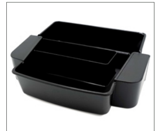
drip tray for pedestal