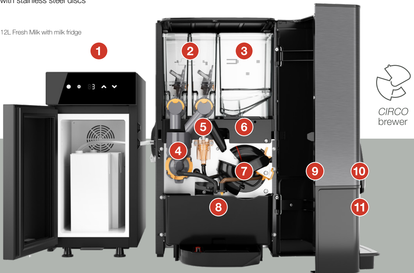
Sego 12L Fresh Milk with milk fridge