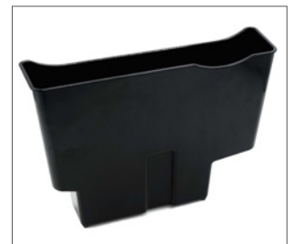
waste bin for pedestal