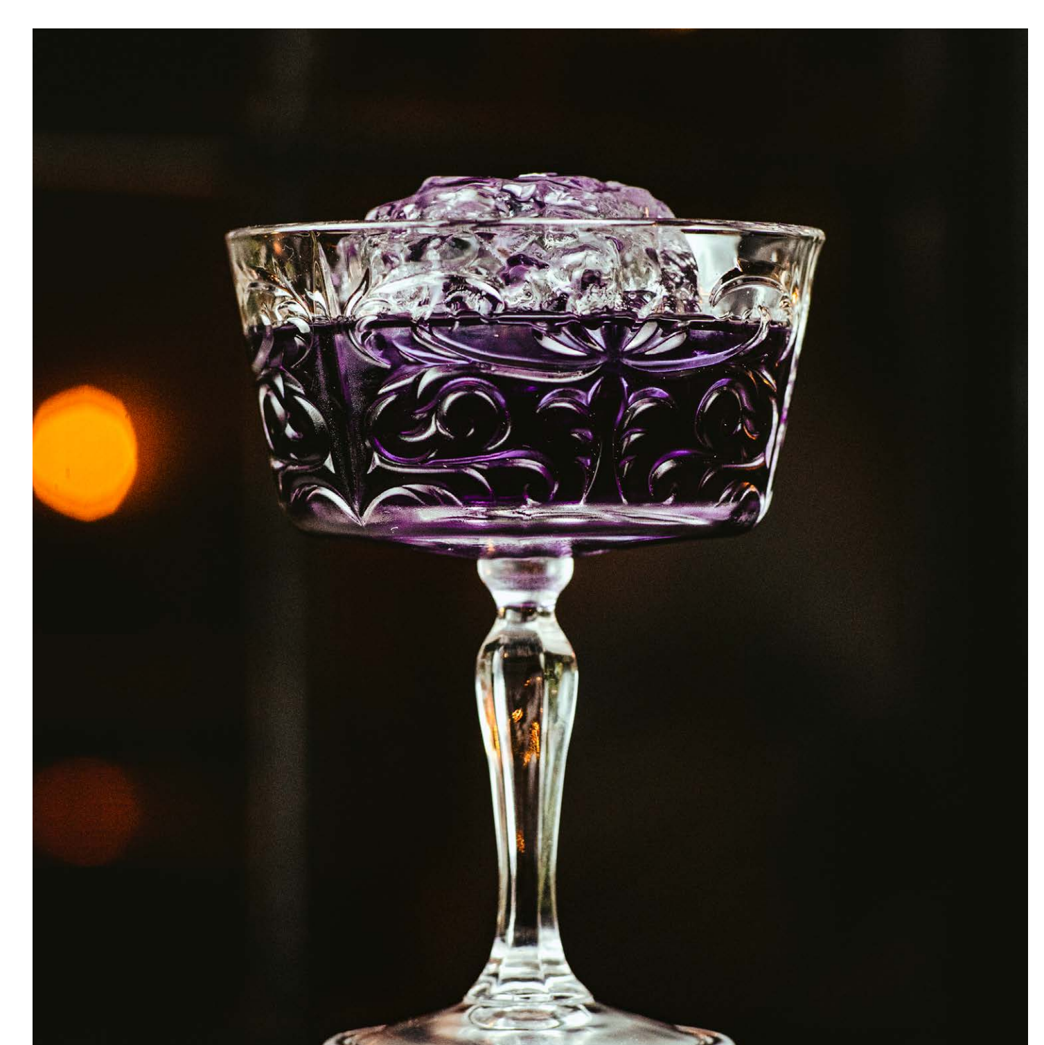
Tattoo is a youthful collection with a contemporary style that evokes Body Art aesthetics. The Clessidra tumblers are ideal as a shot glass or jigger, while the Mule mugs go well with any beverage.