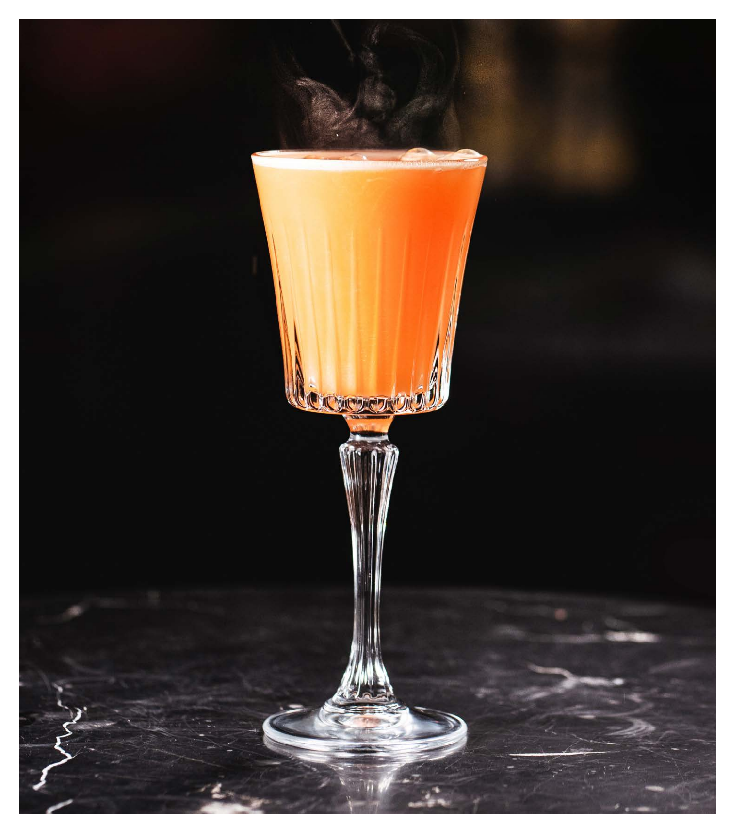
Elegance, unlike fashion, is eternal and gets noticed! Timeless, is a modern collection with unmistakable style, chosen by the biggest alcohol producers for use in their advertising, you will also find it on the set of many major motion pictures and especially in restaurants all over the world.