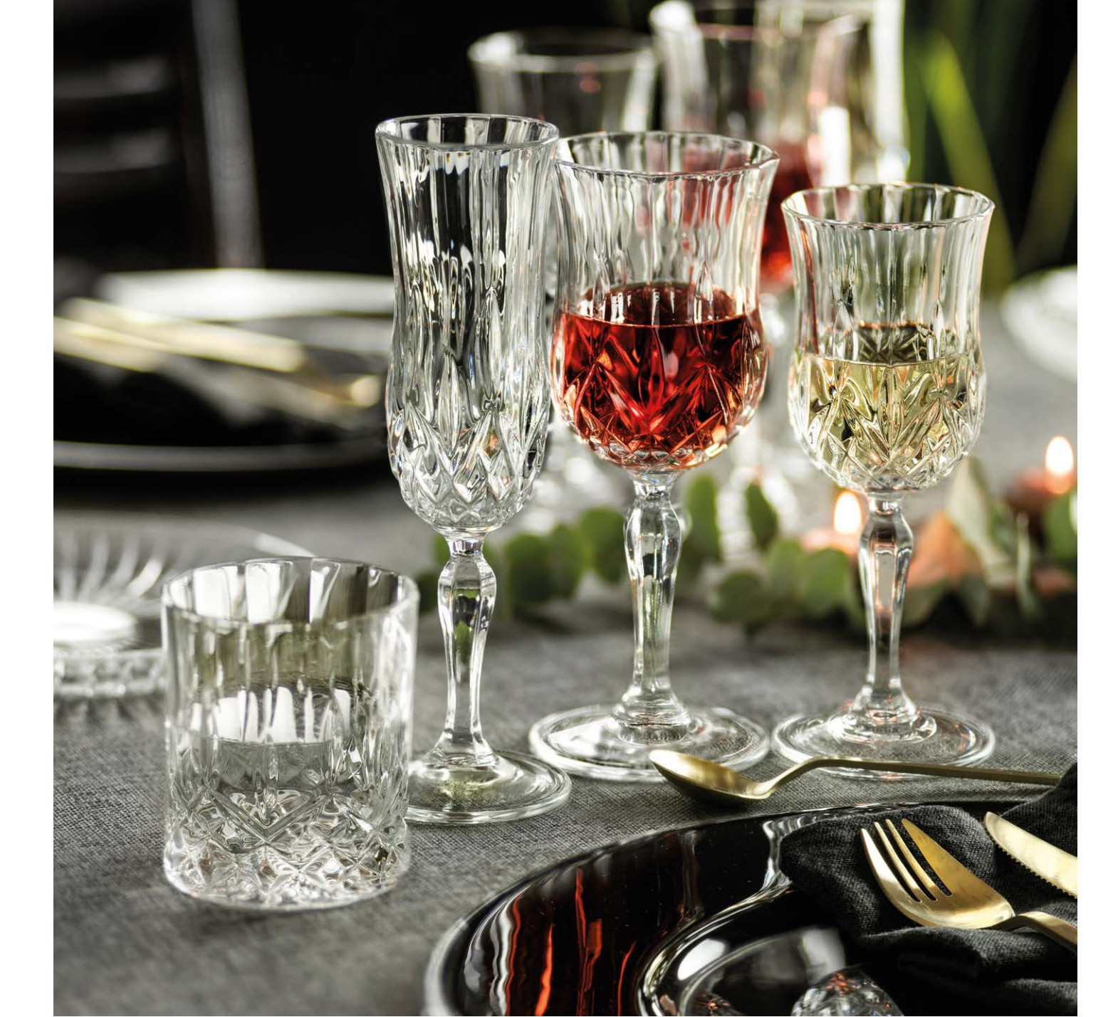
Opera has been part of RCR's history for more than 30 years. Made in Eco-Crystal, it has increased the notoriety of the brand with its timeless "Made in Italy" style.