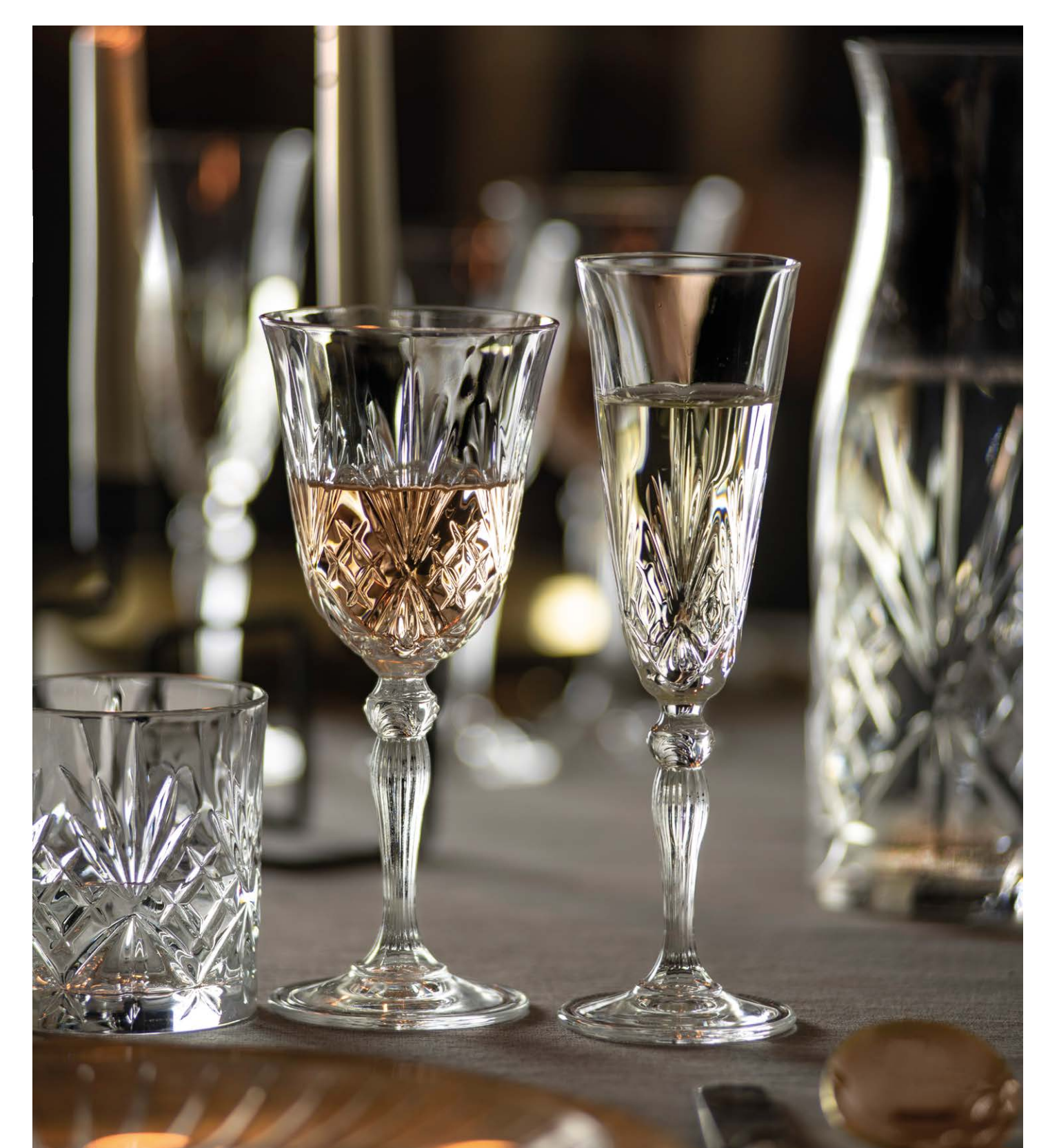
An eternal, comforting and versatile line. Melodia is the favourite glassware of millions of customers and is a major player in the world of Mixology where has established itself as an icon.