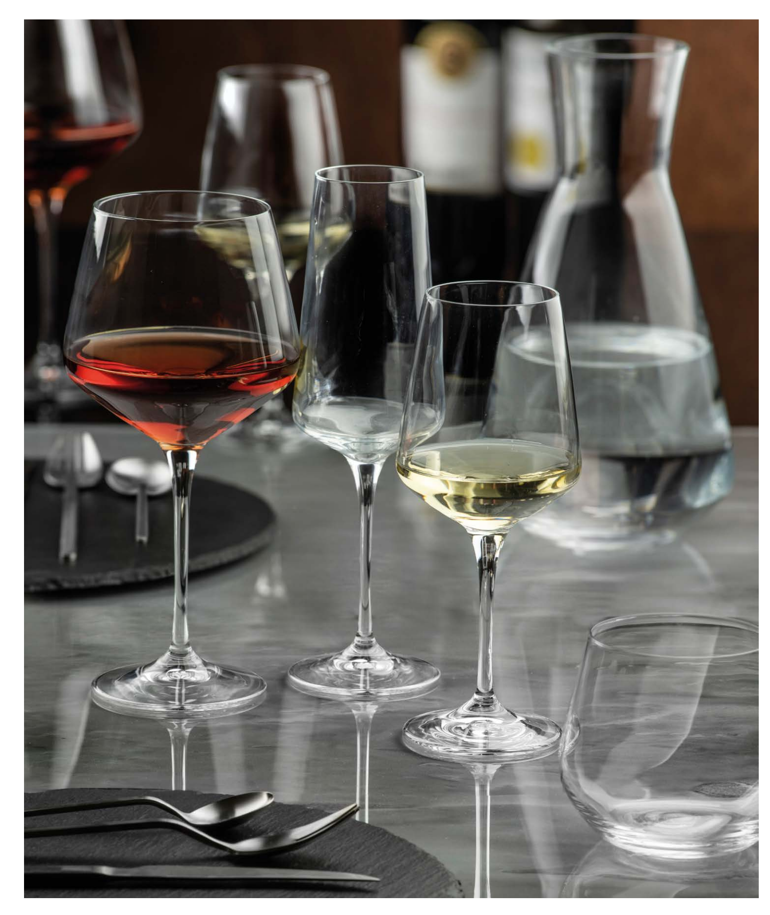
Designed for the finest table settings, Aria is the top range for RCR collections. These thin glasses are very shock resistant thanks to the high-density of eco-crystal. The design of the glass angles in from its widest point, indicating the right level of wine to be poured, while the wide cone-shaped bowl of the glass allows you to appreciate the gradations of colour at its very best.