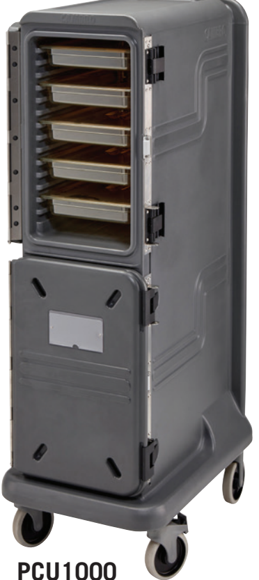
Total capacity 10, 4" (10 cm) deep GN 1/1 Food Pans