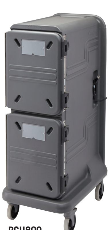
PCU800 Total capacity 8, 4" (10 cm) deep GN 1/1 Food Pans