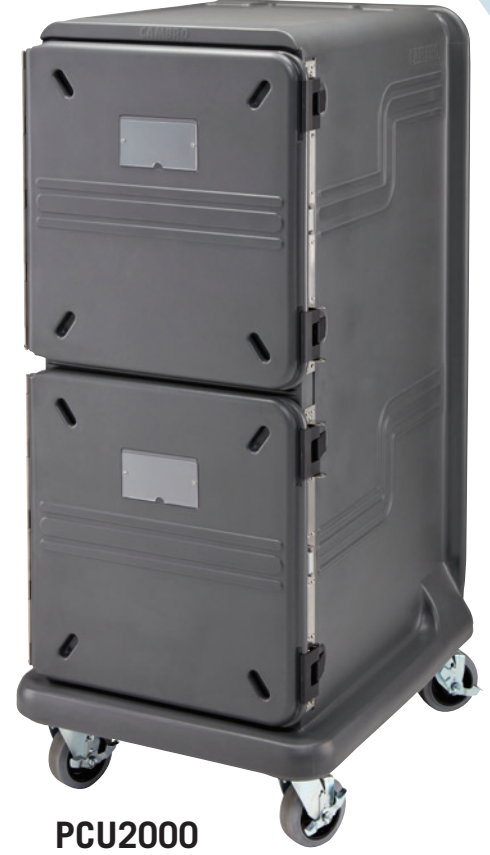
Total capacity 20, 4" (10 cm) deep GN 1/1 Food Pans