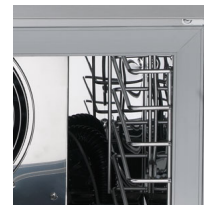
Distance between shelves mm 40