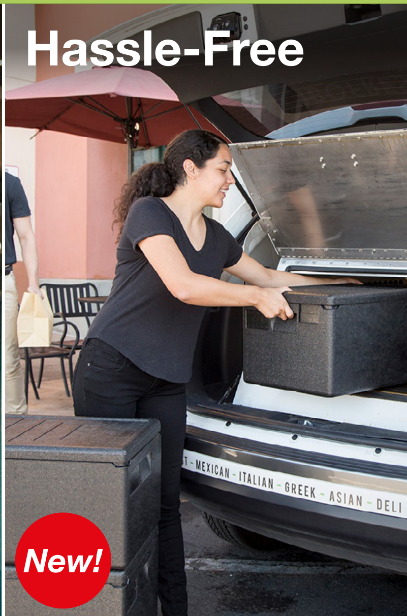
EH903 - PREPARA BLACK RECTANGULAR INSULATED POLYPROPYLENE FOOD CARRIER 1/1 GN